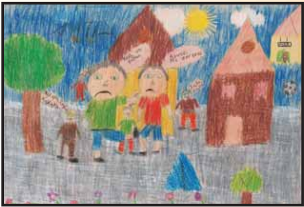
Boy - 5th Grade