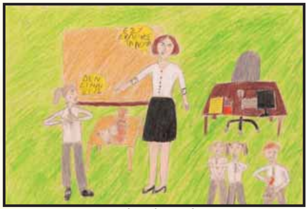
Girl - 5th Grade