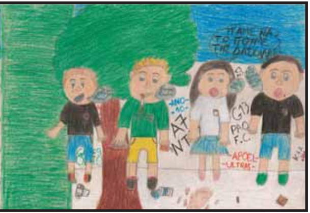
Boy - 5th Grade