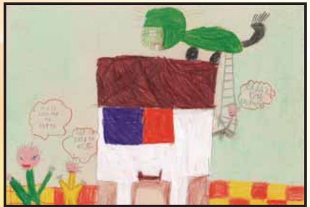
Boy - 5th Grade