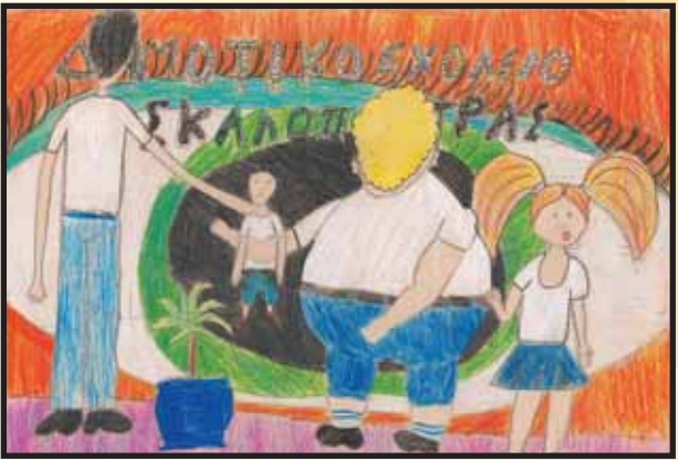
Girl - 5th Grade